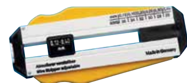
100191 / Wire Stripper