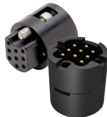
100160 / Female Air-Service Connector 100162 / Male Air-Service Connector (Contacts sold separately)