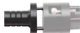
100161 / Air-service Connector Strain Relief (Connector sold separately)