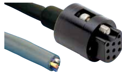
100020 / Female Air Connector to Cable 100022 / Non-terminated Air-Service Cable

1. Used only with high duty cycle stainless steel contacts, fits DCT-1 part number 100190. 2. Includes one each flat, phillips and hex drivers