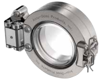
112945 / Viewport 4.5 CF Access Door 7056 Borosilicate Glass

Larger or smaller custom size doors available on request / Compatible with Coniflat® flanges