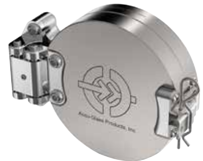
112921 / Blank 4.5 CF Access Door Solid Stainless Steel